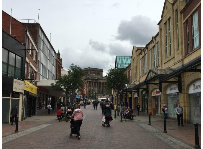
View south along Friargate