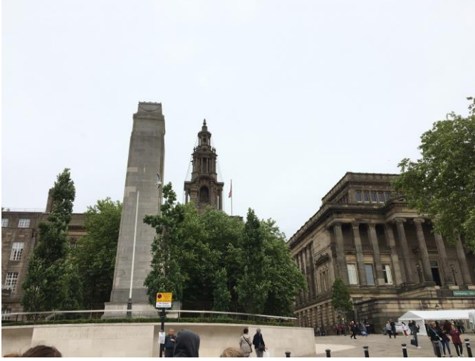
View of Flag Market, Cenotaph and the Harris Museum