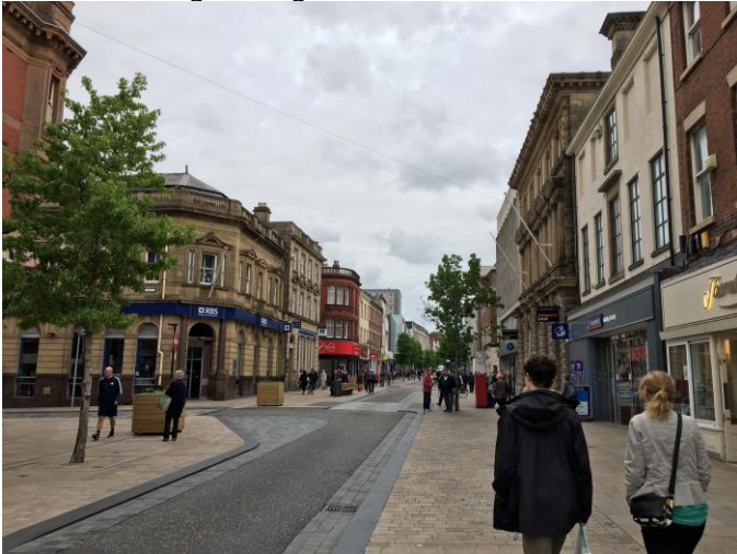
View east along Fishergate