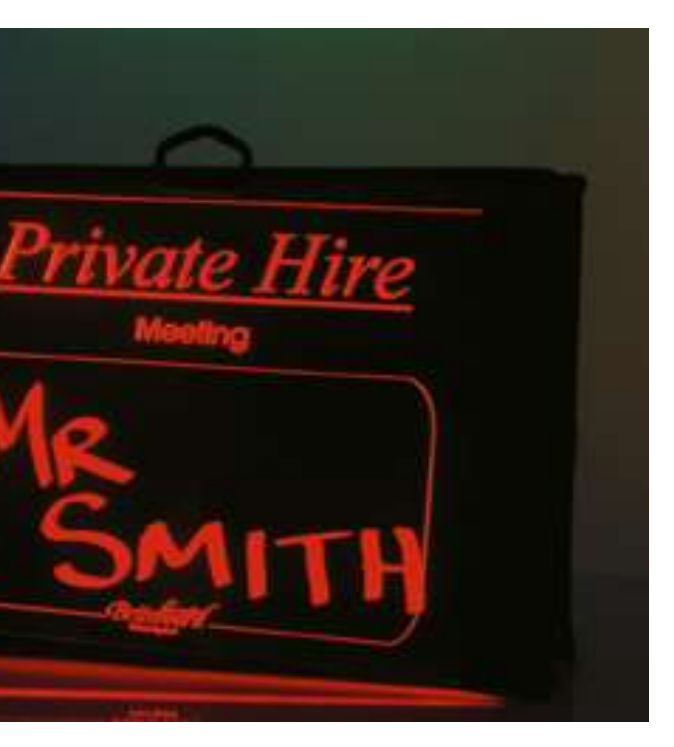
"Briteboard", a means of identifying a PHV driver

Visual confirmation can be achieved using a product called "Briteboard" – this consists of a wipe-clean, acrylic panel, slightly larger than an A4 sheet of paper, that can be hand-held or fixed in the vehicle's window (see Figure 2). Whilst one section of the panel can show "Private Hire" and/or the company's logo, a fluorescent marker pen, in a variety of colours, can be used to write the name of the client on the section below. A really important feature of this messaging