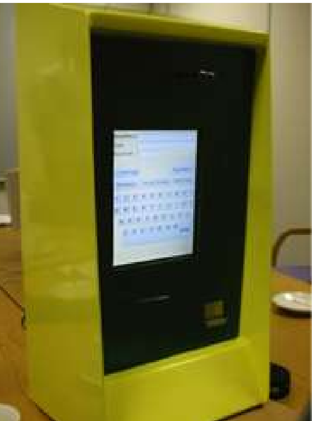
Figure 1: Kerbside booking terminal, (currently under development in London).