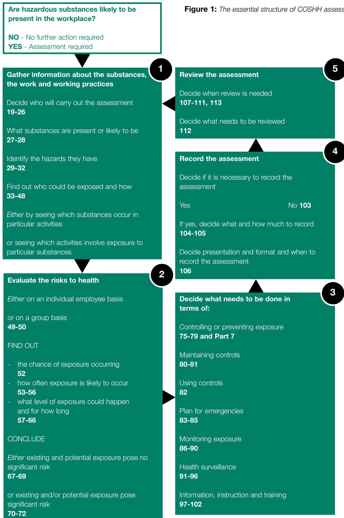
Figure 1: The essential structure of COSHH assessment

Note Bold figures refer to paragraph numbers